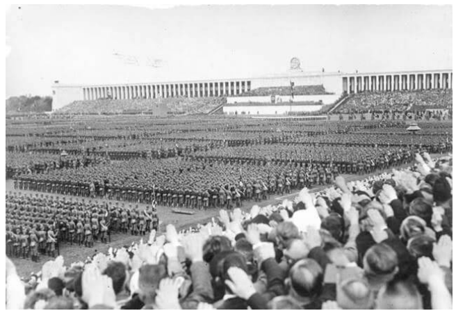
A massive rally at Nuremberg (1937) composed of thousands of men crowded closely together.