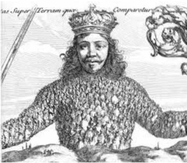
The frontispiece of Leviathan depicts a man whose torso and arms are composed of tiny individual persons crowded closely together.

Never before—and never since—has a nation been so united.